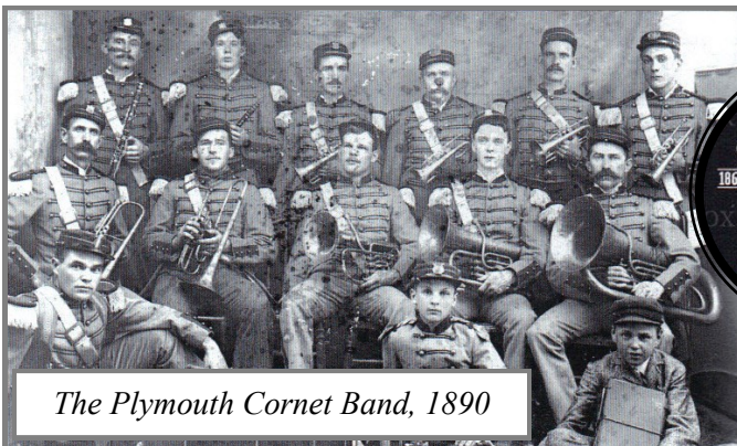
The Plymouth Cornet Band, 1890

The talk is open to the public and admission is free.